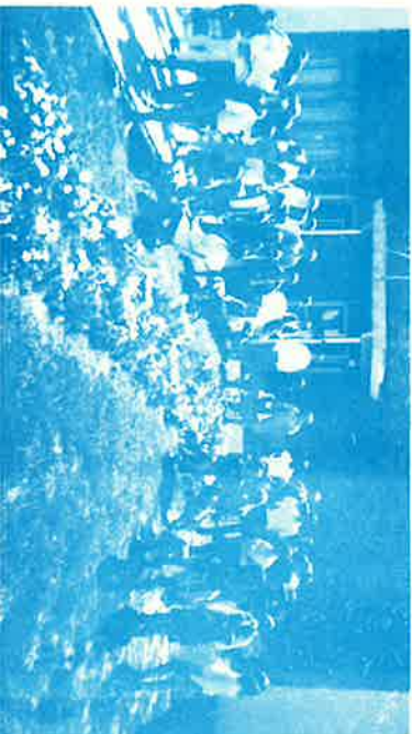
Spring Valers on the lawn in front of the school building.